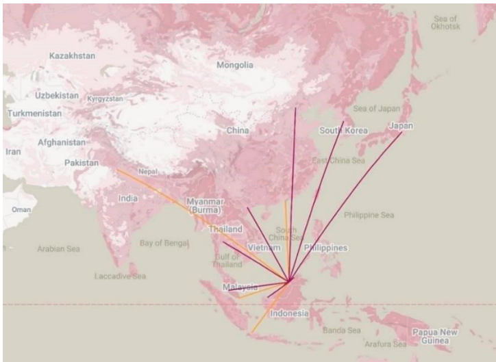
Figure 3: Asia market – Malaysia, Vietnam, Singapore, Indonesia, Thailand, India, Japan, China, Hong Kong, South Korea