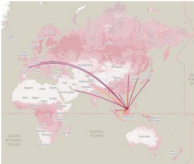
Figure 1: Successful exportation to Malaysia, Vietnam, Singapore, Indonesia, Thailand, India, Japan, China, Hong Kong, South Korea UAE, Czech Republic, and France (red line is indicating active exportation, whereas the yellow line is indicating non-active exportation)

From the results, Brunei Halal food producers can penetrate to Asia market, the Middle East market, and the Europe market. Figures 1-3 will present the exportation countries.