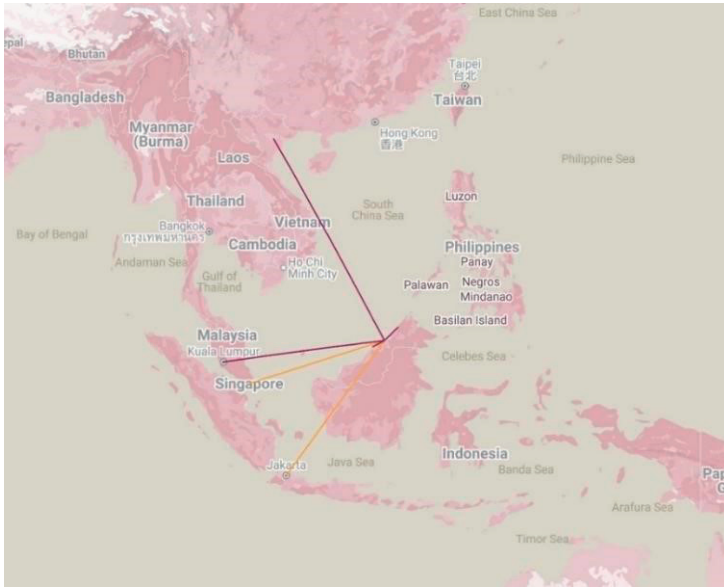
Figure 2: ASEAN market – Malaysia, Vietnam, Singapore, Indonesia