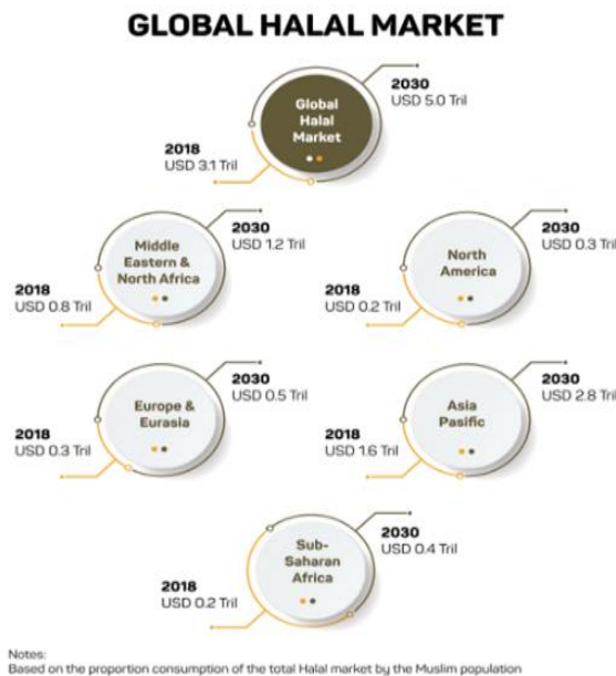
Fig. 2. Global Halal Market